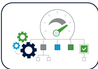
Artificial Intelligence & Data Analytics

We take the pain away from sorting out your business systems so that you can focus on what you do best.