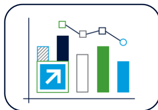
Digital & Technology Integration