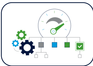
Digital & Technology Integration

We take the pain away from sorting out your business systems so that you can focus on what you do best.