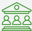
(a) Government entities

The following Kuwaiti and non-Kuwaiti entities are excluded from taxation under the Law: