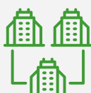
(g) Any entity

(except a pension services entity) where at least 95% (or 85%) of the value of the entity is owned by any of the entities in (a) to (f) above and certain other conditions are met.