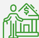
(d) Pension funds