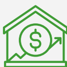
(f) A Real estate investment vehicle that is a UPE