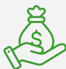
(e) An Investment fund that is a UPE